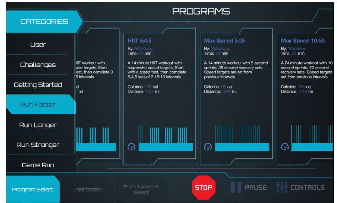
ProSmart Programs View